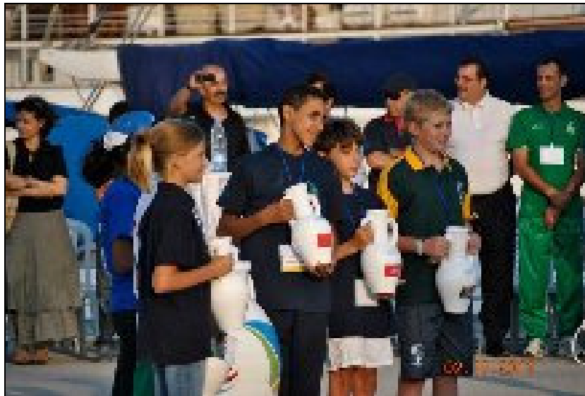
"Mixing of the Waters"

On Saturday 1 October it was time for measurement and registration. At the opening we had a parade, flag hoisting and I represented Team RSA in the "mixing of the waters". Other teams were from Tunisia, Morocco, Egypt, Algeria and Reunion. There were 33 sailors in the fleet. We had a party aboard a pirate themed ship with live music.